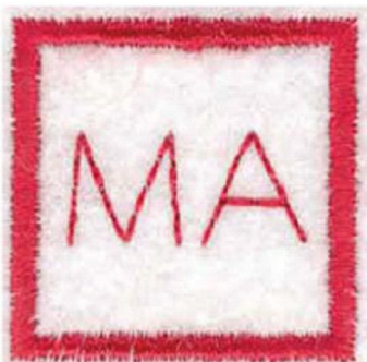
Madeira CLASSIC 40 (702 Stitches)