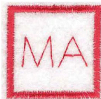
Madeira CLASSIC 60 (723 Stitches)