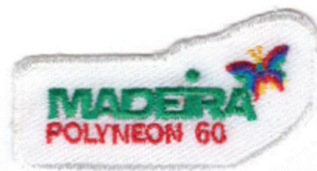
PolyNeon 60 on fine twill fabric